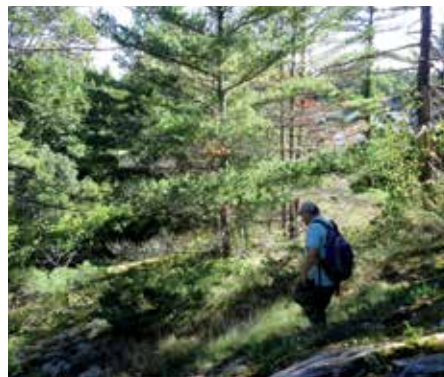
Grant Conservation Easement