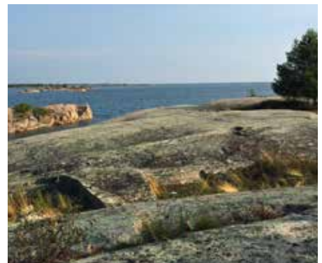
Hangdog Islands Easement