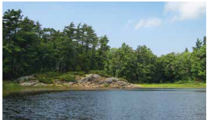
Portage Island Reserve