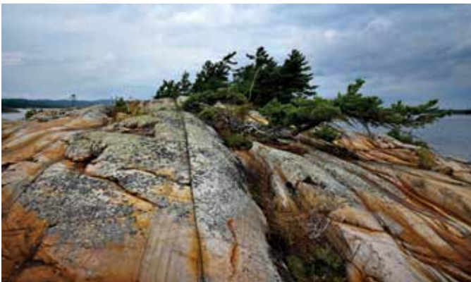
McGregor Bay - La Cloche Mountains

The Portage Island Reserve adds a further measure of connectivity to a large and crucial protected area, neighbouring a section of Georgian Bay Islands National Park and the Cognashene Lake Conservation Reserve. This property includes a variety of important habitats, including a generous and high quality coastal meadow marsh shoreline, open rock barrens, shrubbed rock barrens, and mixed forest communities. A staff visit to the property yielded sightings of several Northern Map Turtles, a very wary—and listed at risk—turtle species that inhabits open water shoreline.