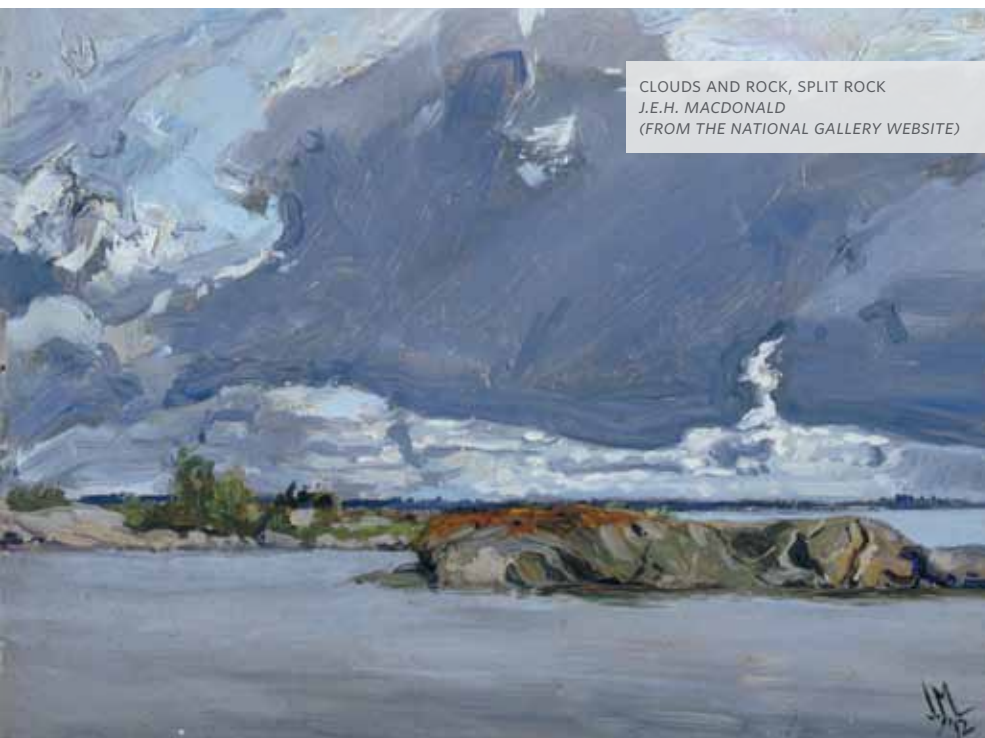
CLOUDS AND ROCK, SPLIT ROCK J.E.H. MACDONALD (FROM THE NATIONAL GALLERY WEBSITE)

Split Rock Island is well known to the Go Home Bay community and Georgian Bayers at large as a signature local landmark. The GBLT is delighted to have been entrusted with the generous donation of the MacCallum Reserve made possible with the assistance of the Ontario Land Trust Assistance Program, an initiative of the Ontario Land Trust Alliance.