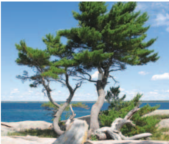
SOUTHEAST WOODED PINE BY SALLY LENNOX

The Georgian Bay Land Trust seeks to preserve the unique archipelago and the adjacent water bodies which lie along the eastern shore of Georgian Bay and North Channel that are of ecological, geological and historical importance, and to promote the appreciation of this special area.