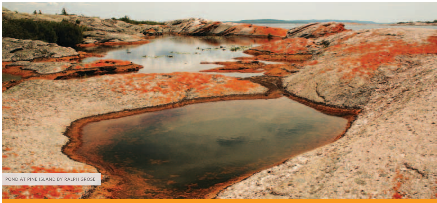
POND AT PINE ISLAND BY RALPH GROSE