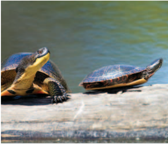
BLANDING'S TURTLES BY GORD DARLINGTON